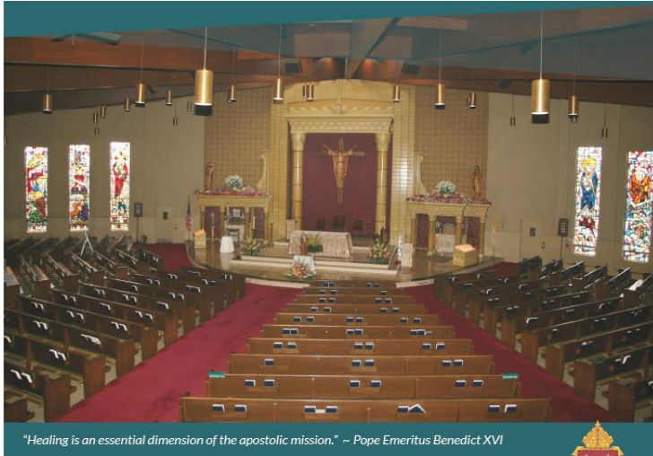
"Healing is an essential dimension of the apostolic mission." ~ Pope Emeritus Benedict XVI

Are you finding those great Winter & Spring-cleaning bargains? DON'T PASS THEM UP! You can start collecting items now for our 13 th Annual Basket Social coming in October. The committee is also looking for various basket and item donations to create even “better than ever” baskets. Feel free to drop off bargain Irish, Easter, spring, or just about any non-perishable items at the church office. We'll store them and create wonderful baskets as our social draws near. Thanks for your support!