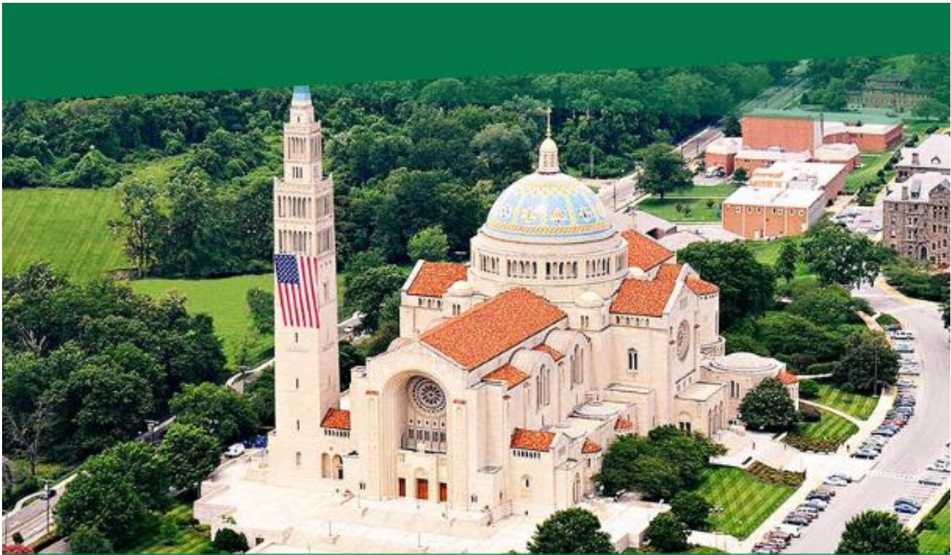
The Basilica of the National Shrine of the Immaculate Conception