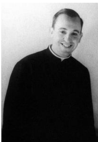
Jorge Mario Bergoglio as a young priest.