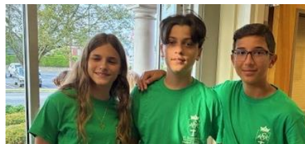
Some Student Council greeting students