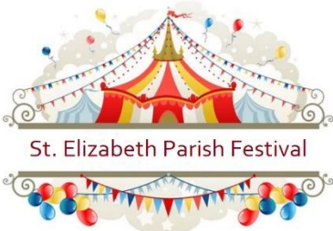
St. Elizabeth Parish Festival

St. Elizabeth Annual Parish Festival will be held on June 9 and 10 this year. Mark your calendars and invite everyone you know!