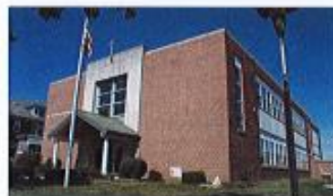
Saint Elizabeth Regional School

Office Hours: 9 AM – 3 PM – Monday-Thursday