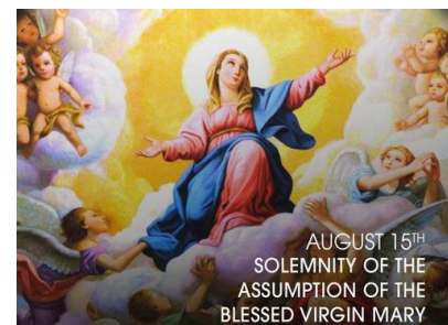
AUGUST 15 TH SOLEMNITY OF THE ASSUMPTION OF THE BLESSED VIRGIN MARY

Monday evening Vigil at 6:30 pm - Tuesday morning at 9:00 am and afternoon 12:15 pm The Assumption is the oldest feast day of Our Lady, but we don't know how it first came to be celebrated. Its origin is lost in those days when Jerusalem was restored as a sacred city, at the time of the Roman Emperor Constantine (c. 285-337). The Assumption completes God's work in her since it was not fitting that the flesh that had given life to God himself should ever undergo corruption. The Assumption is God's crowning of His work as Mary ends her earthly life and enters eternity. The feast turns our eyes in that direction, where we will follow when our earthly life is over.