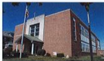
Saint Elizabeth Regional School

Office Hours: 9 AM – 3 PM – Monday-Thursday