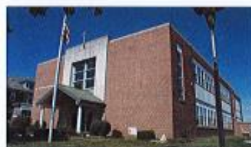
Saint Elizabeth Regional School

Office Hours: 9 AM – 3 PM – Monday-Thursday