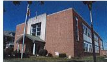
Saint Elizabeth Regional School

Office Hours: 9 AM - 3 PM - Monday-Thursday