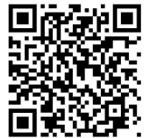
ALL TICKETS MUST BE PURCHASED BY FRIDAY, JANUARY 19TH