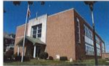
Saint Elizabeth Regional School

Office Hours: 9am-4pm - Mon-Thurs. and 9am-12pm Fri.